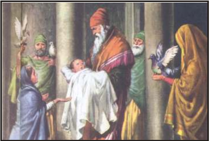
Jesus at the temple on the 40th day