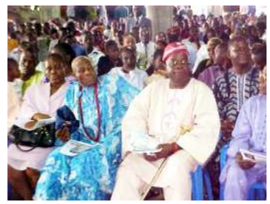
Natural Rulers listen with rapt attention