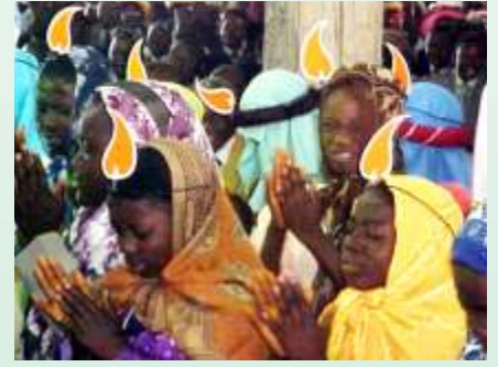
Oyo State children illustrate the receipt of the cloven tongues like as of fire