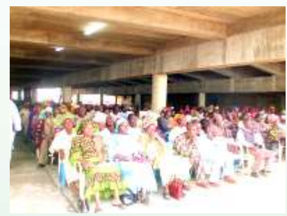
A section of Ministers and Workers at the Tabernacle basement