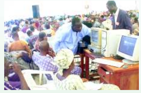
The electronic crew recording and amplifying proceedings at the meeting