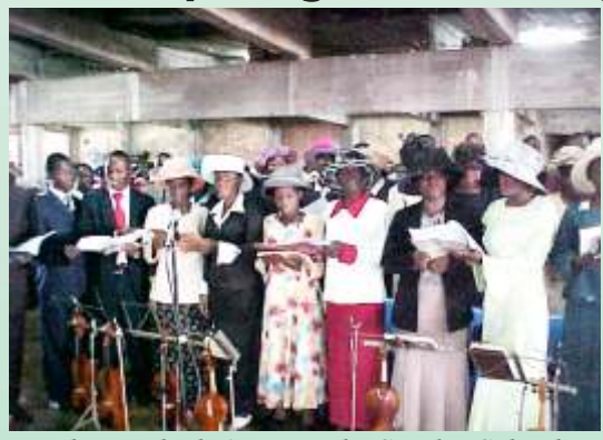
The youth choir opens the Sunday School with beautiful songs