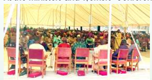
Ministers and Workers listen with rapt attention