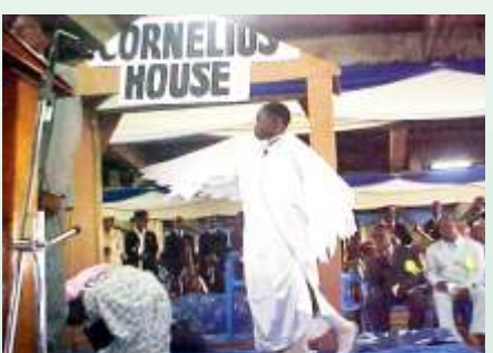
Ogun State children reassure listeners that the Holy Ghost fire is also for the Gentiles