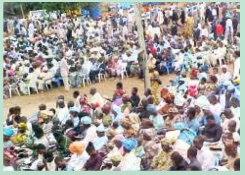
Spill over of the congregation outside the Tabernacle basement