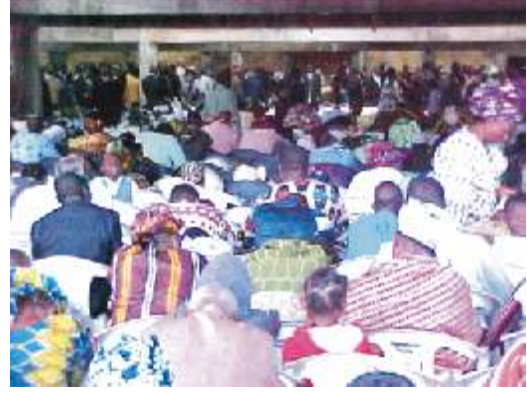
Campers seek the face of God

"And the angel of the LORD appeared unto him in a flame of fire out of the midst of a bush: and he looked, and, behold, the bush burned with fire, and the bush