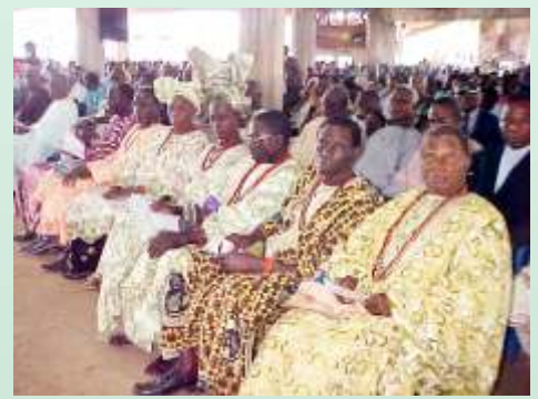
Dignitaries did not miss the concert.