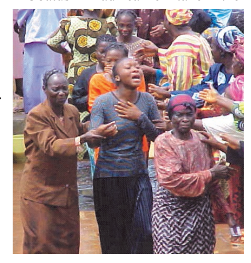
A sister is overwhelmed with joy after her water baptism

second and the third Sunday School lessons respectively.