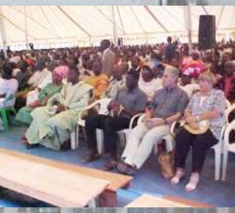
Diplomats and Public Figures