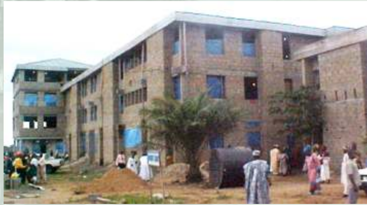
The Administrative Block for the proposed Crawford University used for accommodating campers