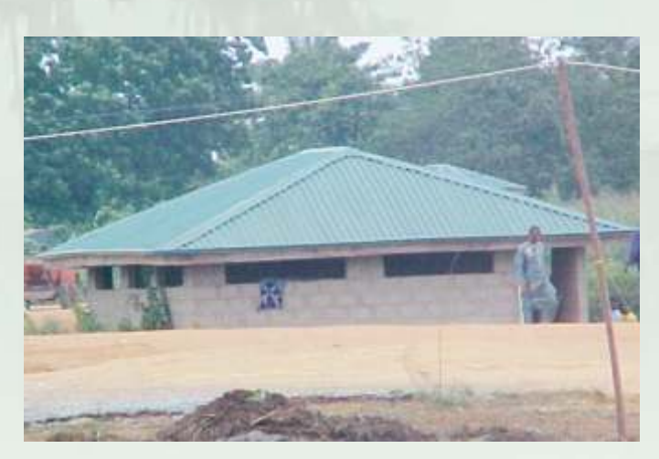
One of the public conveniences