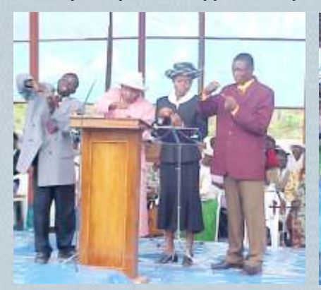
The Hearing-Impaired signing 'Jesus Lover of My Soul'

The Physically Handicapped But Spiritually Active