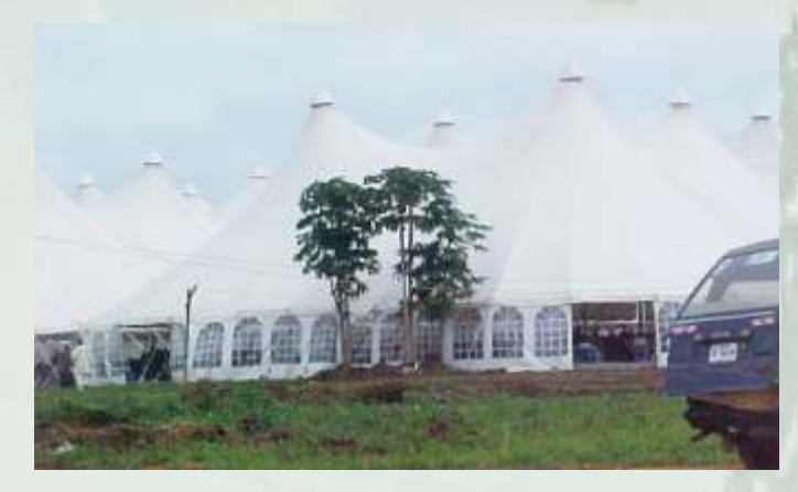
A view of the tent church