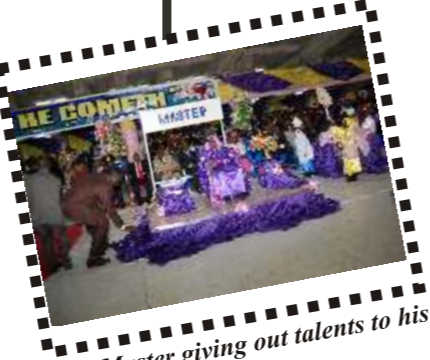
The Master giving out talents to his servants