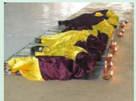
The Ten Virgins Sleeping

The Ogun District Sunday school children mounted the stage on August 14, to exhort the audience to get prepared to meet the Lord when He shall appear in the sky. The children went into recitation of (Continued on Page 4)