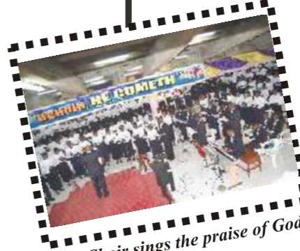
The Choir sings the praise of God