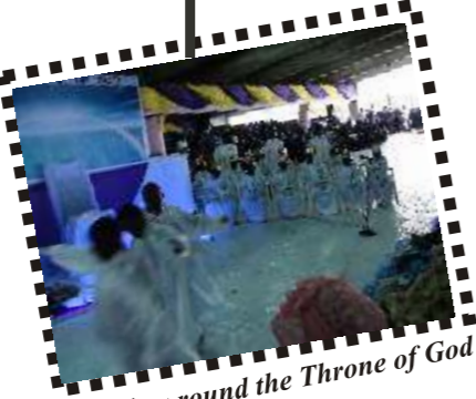
Elders round the Throne of God in action