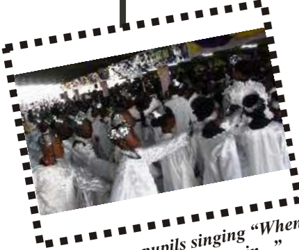
Elementary pupils singing "When the Saints are marching in..."