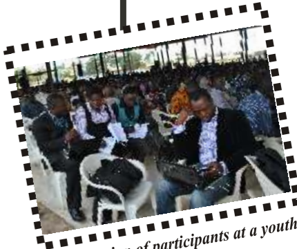
Cross section of participants at a youth seminar