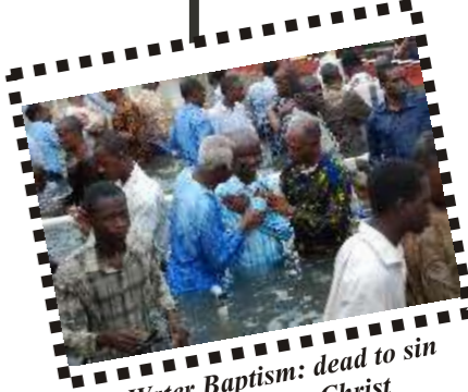
Water Baptism: dead to sin but alive to Christ