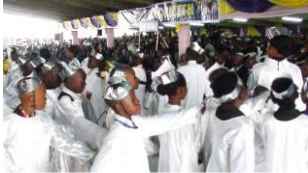
Reward to the faithful

melted as they filed out of the podium, leaving the eyes of their audience glistening with tears.