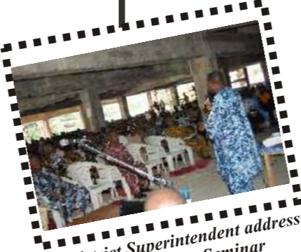
The District Superintendent addressing pastors at the Seminar