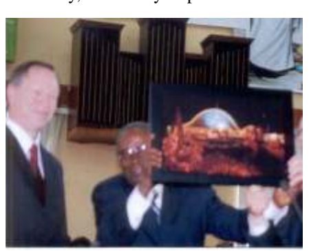
A gift from Portland

In Lagos, the missionaries were at Faith City, where they inspected the